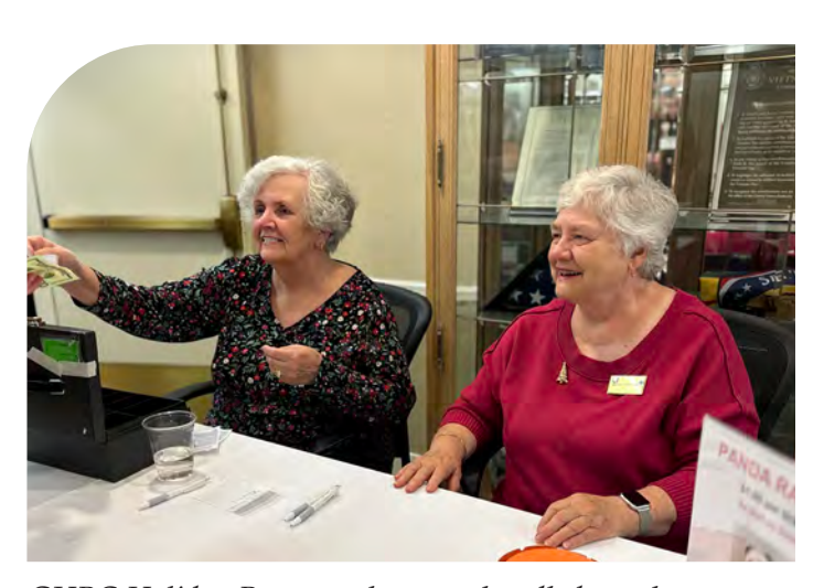
GHBC Holiday Bazaar volunteers handled purchases and gave smiles away for free!

Thank you to the residents and team members who were valuable participants and leaders with these auxiliary programs, including the Market Place and Craft Shop at GHA, the WhatNot Shop and Holiday Bazaar at GHBC, art sales commissions, holiday card sales and craft fair sales. The Foundation is grateful for all who have donated items, and we especially thank the customers, the many volunteer workers and the residents who dedicate their time and talents to these efforts.