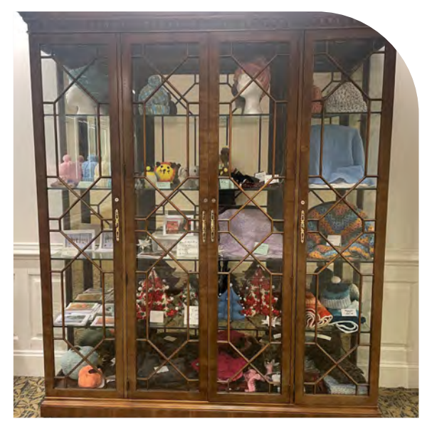
A display cabinet showcases GHA Craft Shop items that are hand-made by residents.

After spending years accumulating possessions, many residents often desire to let go of items they no longer need or want. The Market Place at GHA and the WhatNot Shop at GHBC are two places where residents donate many of these unwanted treasures, knowing that they will go to help create new gifts for the Goodwin Living Foundation and bring joy to their new owners. Additionally, the GHA Craft Shop offers hand-made items, and residents at both houses sell fine art. The Holiday Bazaar at GHBC is an event that many look forward to each year. All proceeds from sales, $79,985 in fundraising year 2023, go to the Foundation's Resident Support Fund. This is the highest amount ever raised by this group of volunteers.